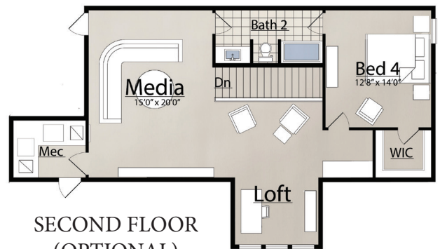
SECOND FLOOR (OPTIONAL)